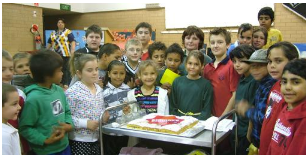
Schools First Assembly—cutting the cake