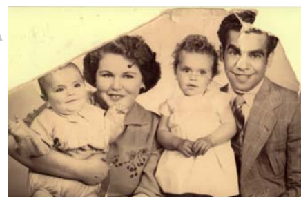
THE KELLY FAMILY

Students from our middle school from Years 5 to 8 have been reading the book for the