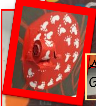
Art work that students were creating last week with Blake Griffiths from the Broken Hill Art Gallery.