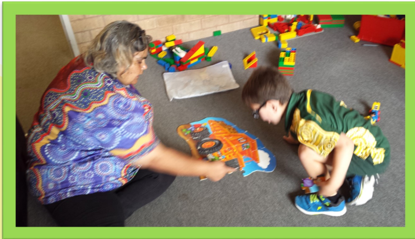
SLSO Oakley and Yr 1 student putting a jigsaw puzzle together.